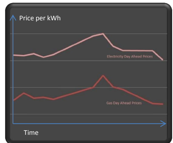
Energy Prices from August Week 3 onwards

Over the course of 2011, wholesale prices for Electricity and Gas have steadily increased.